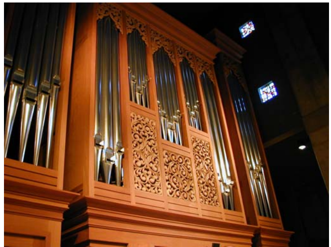
The organ at St. Stephen's, Belvedere

http://www.selahpub.com/MusicInWorship/CommissioningMusic.html